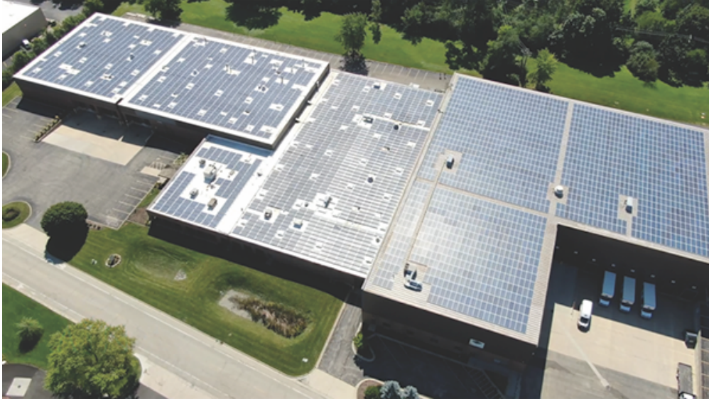
Rainy Solar's rooftop photovoltaic solar array at 1111 Davis Rd., Elgin, Ill., is Illinois' 1st APB community solar project.

We are proud to be part of the Rainy Solar Project and future projects in Illinois to support a clean energy state.